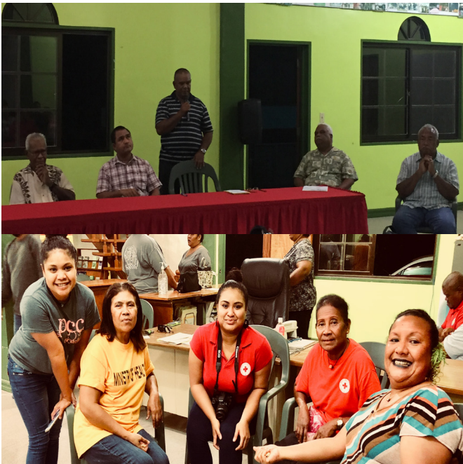
Top: Care-Giver Training honor guests, Bottom: PCC, MOH, and PRCS instructors and staff

PCC, Ministry of Health, and Palau Red Cross Society congratulate participants for completing the training and thank them for taking part on this very worthy and humble training to assist our elders and bedridden family members.