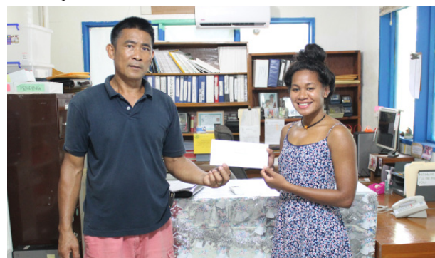
The Penthouse purchased 50 tickets worth $500.00