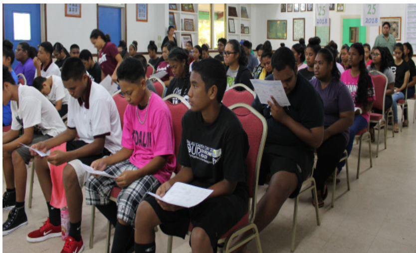
Upward Bound program orientation for new and continuing participants in PCC Assembly Hall

Palau Community College - Upward Bound Program held their Fall Student Orientation on Monday, October 2, 2017 for the 2017-2018 Academic Year. Students from the local high schools attended the session to learn more about the Upward Bound classes, workshops, and related program information.