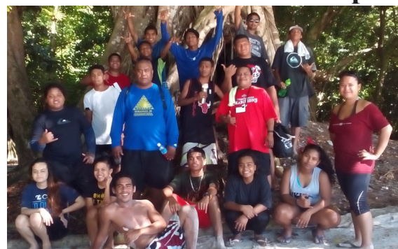
CTE Lab School students and teachers at Ulong Island