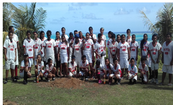
Educational Talent Search students from Melekeok during cultural trip to Ngarchelong State