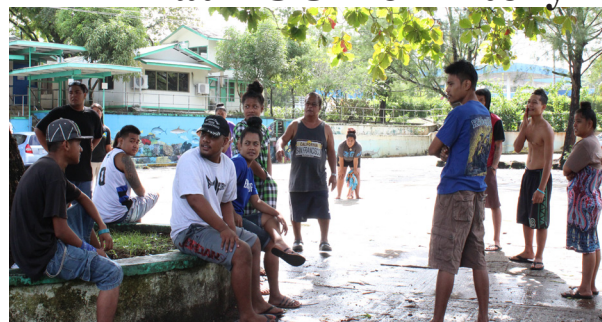
PCC Dormitory students and dorm manager during post evacuation drill head count

On Thursday, December 27, 2018 Palau Community College Emergency Preparedness Task Force conducted an emergency evacuation drill to all students at PCC Dormitory. The task force members were present to observe, review and evaluate its effectiveness and ways to improve the colleges emergency response. This activity is one of the many evacuation drill planned to take place in months to come. As result of today's evacuation drill, all students and staff were evacuated to a Designated Safe Assembly Areas in less than two minutes. PCC thank all students and dormitory staff for their cooperation, assistance and participation in this emergency preparedness activity.