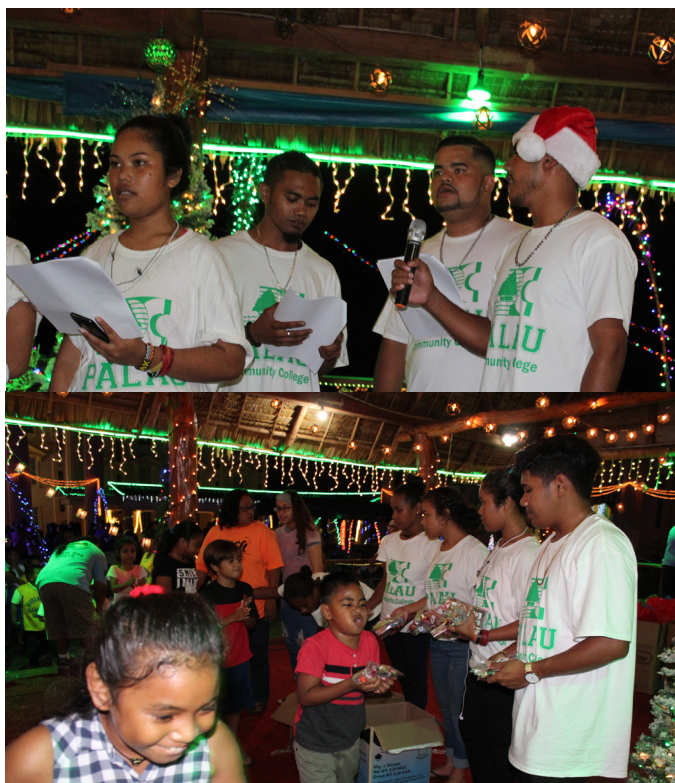
PCC Music Club performs at Childrens Christmas Program