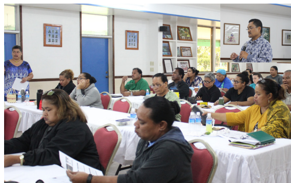
PCC staff attended Federal Student Aid training in Assembly Hall

On January 3-4, 2019 Palau Community College (PCC) staff underwent a two-day training on Federal Student Aid.