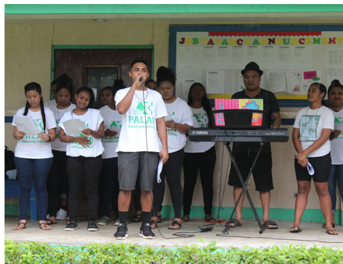
2018 PCC Music Club performing special numbers during employee christmas luncheon

On Thursday, December 20, 2018 Palau Community College employee held its Christmas Luncheon to recognize and thanked all college staff for their dedication and hard work over the year. All together, staff and students shared the wonderful moments filled with christmas spirit and songs performed by PCC Music Club.