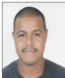
JB Victorino Kitalong David Shipper Memorial Scholarship