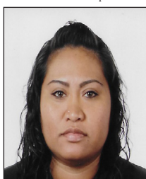
Valyne T. Ilek Sandra S. Pierantozzi Scholarship