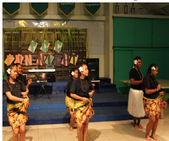
Republic of Palau Student Organization performing contemporary dance at cafeteria