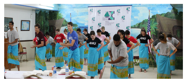
ANU & UH students performing palauan comtemporary dance at PCC Assembly Hall