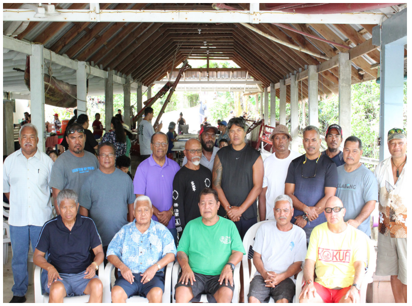
Pwo Ceremony at PCC Taoch era Idederach canoe house with inductees and guests

From July 9-12, 2019 Palau Community College hosted the first Pwo Ceremony at PCC Idederach Canoe House. The four-day training of soon to become master's in traditional navigation required them to stay in the canoe house without leaving the area, dine together with local food and coconut juice until the training is completed.