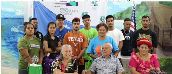
Kosraens with FSM Vice President