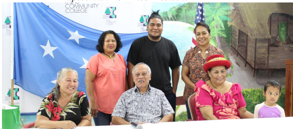
Chukese with FSM Vice President