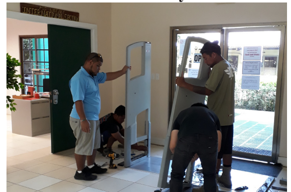
PCC Maintenance and library personnel participate in the installation