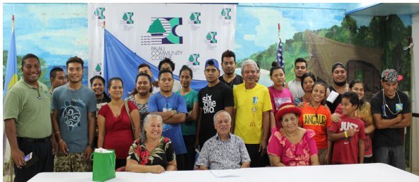
Yapese with FSM Vice President