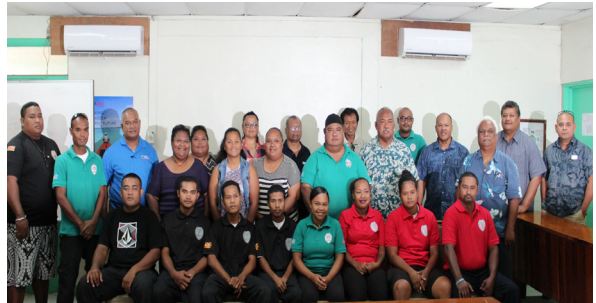
2019 Ecological Monitoring Training Awarding Ceremony

On Tuesday, August 27, 2019 Palau Community College in collaboration with Palau International Coral Reef Center, Protected Area Network, and Protected Area Network Fund awarded certificate to Ecological Monitoring Training participants from Aimeliik, Melekeok, and Ngardmau States. The two-week training provided needed knowledge and skills to equip States PAN officers in monitoring protected areas.