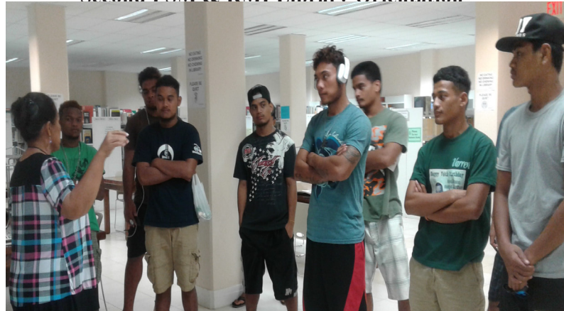
Students from FSM and RMI during library orientation

On September 21, 2019, PCC library held a 2nd FSM & RMI Library Orientation to help students gain knowledge and skills necessary for them to conduct research and obtain reference information on their own. Twelve students participated in the session which included a tour of the library (1st & 2nd floors), an explanation of the kind of information that each section of the library holds, and an opportunity to apply for a free library card.