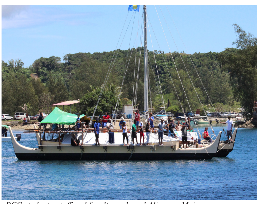
PCC students, staff and faculty on-board Alingano Maisu

On Sunday, September 29, 2019 Palau Community College (PCC) administrators, staff, faculty and students participated in the Republic of Palau 25<sup>th</sup> Independence Day flotilla at the Japan-Palau Friendship Bridge.