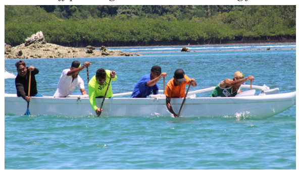
PCC students during canoe racing