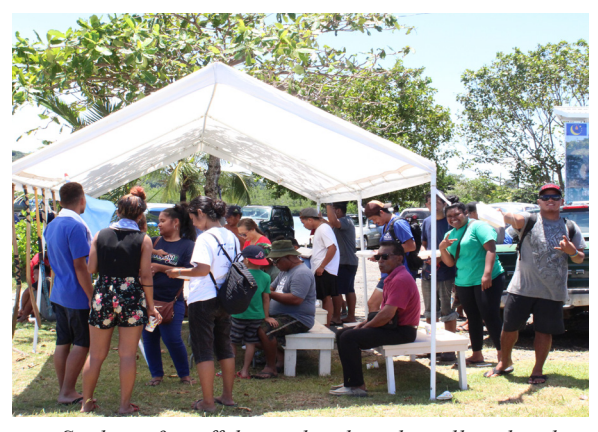
Students & staff during lunch at the college booth