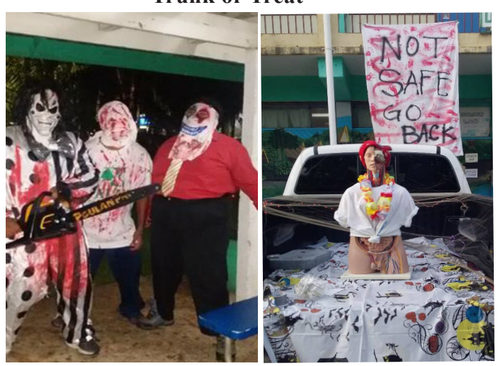
Associated Students of Palau Community College hosted this year's Halloween "Trunk or Treat" night at PCC campus.