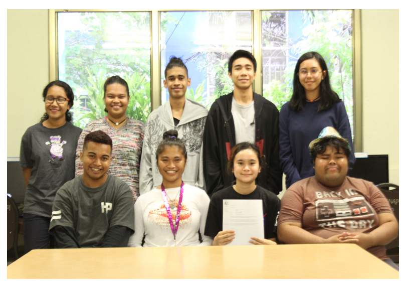
PCC Health Club members at Learning Resource Center

On Tuesday, October 29, 2019 PCC Health Club was officially recognized as one of the college student clubs.