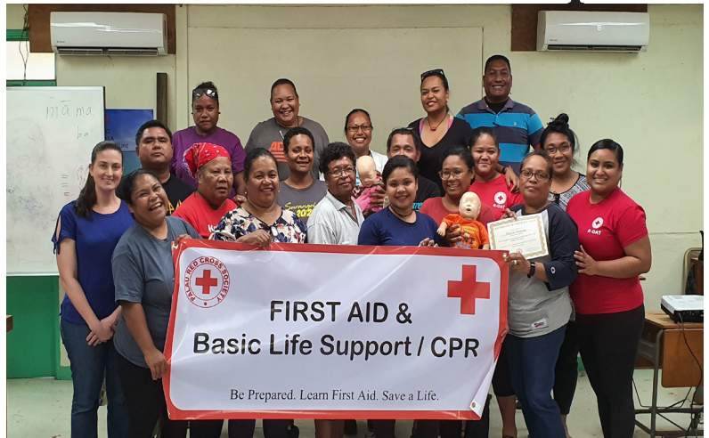
PCC staff during First Aid & CPR training at CE Continuing Educa tion with PRCS instructors

On Thursday, November 14, PCC staff participated in a First Aid & Basic life Support/Cardiopulmonary resuscitation (CPR) training held at Continuing Education training room. Over twenty staff from various offices participated in this one-day training to equip themselves with necessary skills needed to assist students and staff in case of injury or illness. First aid and CPR are the provision of initial care and may be performed by trained individual who do not have medical background. The training is to ensure PCC staff are well prepared for any medical emergencies on campus.