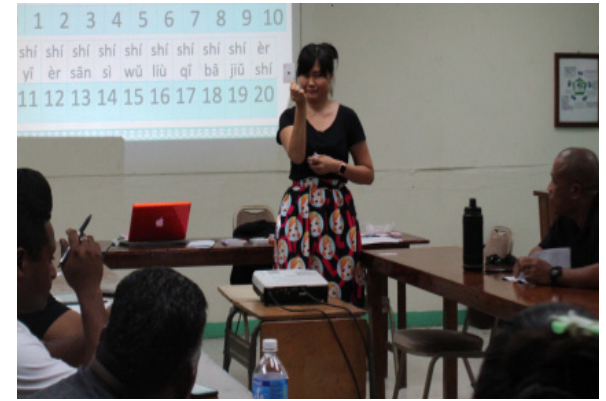
Mandarin basic communication class offered to government employee at CE training room

Basic Conversational Mandarin Class Commence