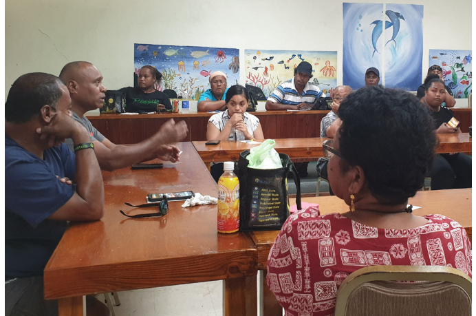
CSO regular meeting at PCC Continuing Education training room

On Wednesday, January 15, 2020 PCC Classified Staff Organization held its 1 st regular meeting of the year 2020. The meeting's main discussion was the "End of the Year Get Together" activity. Members decided to have a rock island tour and lunch at Chelechol ra Kesiil beach. All members agreed to have activity on Saturday, February 8, 2020.