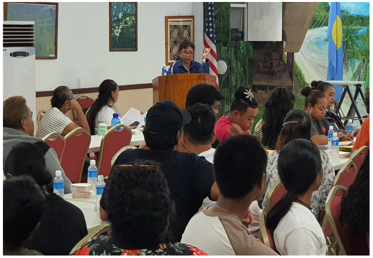
Students and Parents during Financial Aid Night at PCC Assembly Hall

Palau Community College Office of Financial Aid conducted financial aid sessions to all high school seniors and their parents at PCC Assembly Hall. The financial aid workshop began saturday 2/8/20 and continue until Tuesday, 2/18/20. Over 170 high school seniors attended the sessions and filled out Federal Student Aid application forms for the upcoming school year 2020-2021.