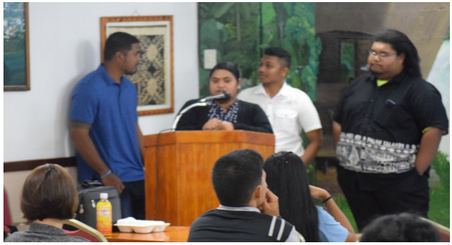
ETS alumni special presentation during ETS seniors & parents workshop at Assembly Hall