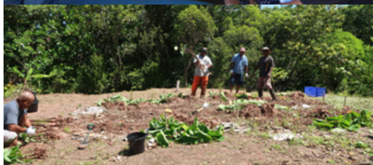
PCC CRE staff and training participants during taro harvesting of plots

In February 2020 Palau Community College Cooperative Research & Extension - Expanded Food Nutrition & Education Program conducted Food Security and Agricultural Conservation workshop. The program taught community participants on sustainable taro production based on conservation to reduce soil erosion and increased yield in dry land taro production (Sers). The program also include harvesting of taro plots. There were 6 demonstration plots of 20x20 feet square and a total of 20 farmers attended harvesting. Each demonstration plot consists of 4 sub plots; 2 for conventional and 2 for conservation agriculture. Six demonstration plots planted last year in September were also harvested together with the assistance from PCC-CRE staff. With this agricultural conservation method, the community will have the ability to gain knowledge in sustainable agriculture production and food security.