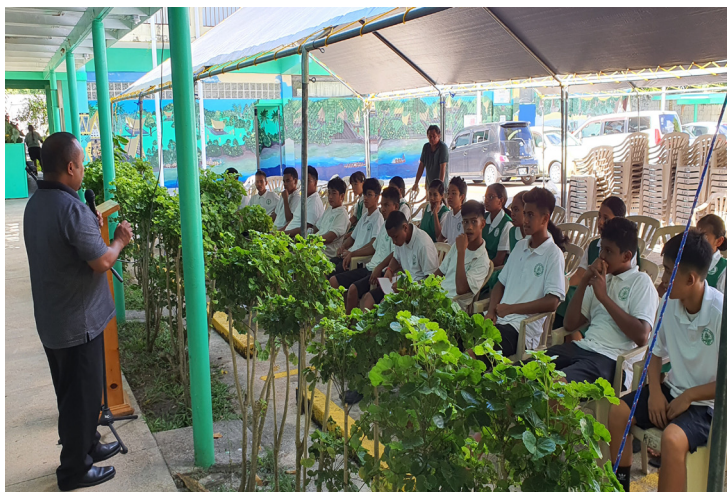
Dean of Academic Affairs welcoming students from Maris Stella Elementary School

This week, Palau Community College (PCC) hosted its Career & Technical Education (CTE) Awareness Week. On Wednesday, March 18, 2020 and Thursday, March 19, 2020 students from different elementary schools and high schools in Palau were invited to tour the campus and learn about the programs currently offered at the college. Students and staff members were led on tours by PCC ASPCC students. Campus tour stations included agricultural science, environmental/marine science, CTE lab school classroom, construction technology, welding, automotive technology, small engine & marine technology, air conditioning & refrigeration, electrical technology, general electronics technology, and information technology. Students from the following schools participated in the two-day event: Meyuns Elementary School, George B. Harris Elementary School, Peleliu Elementary School, Melekeok Elementary School, Emmaus-Bethania High School, Belau Modekngei School, Palau High School, Koror Elementary School, Ngaraard Elementary School, Ngarchelong Elementary School, Ngeremlengui Elementary School, Ngardmau Elementary School, and Maris Stella School. CTE AWARENESS WEEK, CONTINUED ON PAGE 2