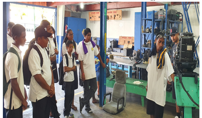
Small Engine & Outboard Marine Technology