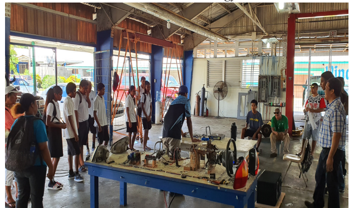
Automotive Mechanics Technology