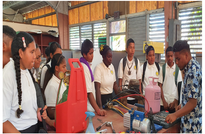
Air Conditioning Technology