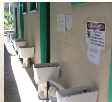
Ksid Bldg. Restrooms