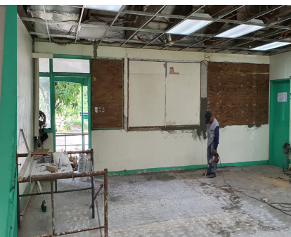
CE Training Room