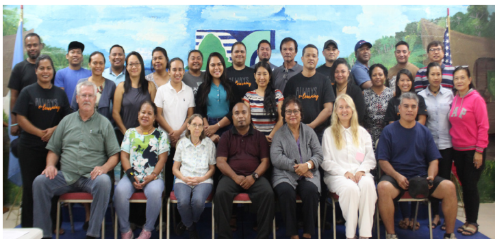
Dean of Academic Affairs with PCC faculty