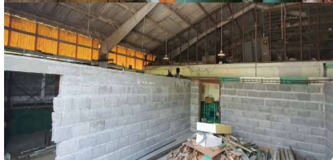
General Electronics Technology under renovation

Palau Community College Tekrar building which houses General Electronics Technology (GET) program is currently in the process of remodeling to accommodate more instructional classrooms, laboratory, and storage room.