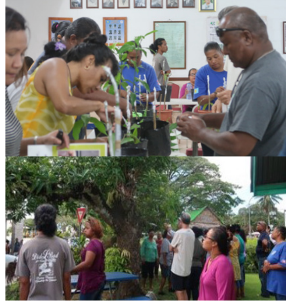
Food Security Program participants during grafting and pruning demonstration

Participants were given also given time to graft and prune their own tree provided by PCC CRE Research and Development Station in Ngermeskang, Ngeremlengui.