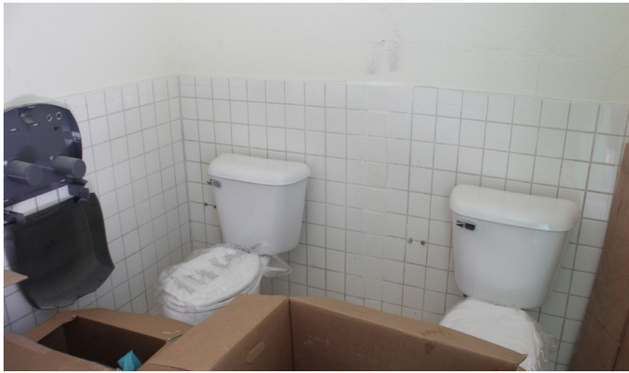
Ksid Bldg. Restrooms