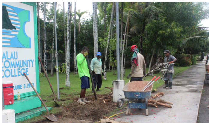
PCC front lawn landscaping