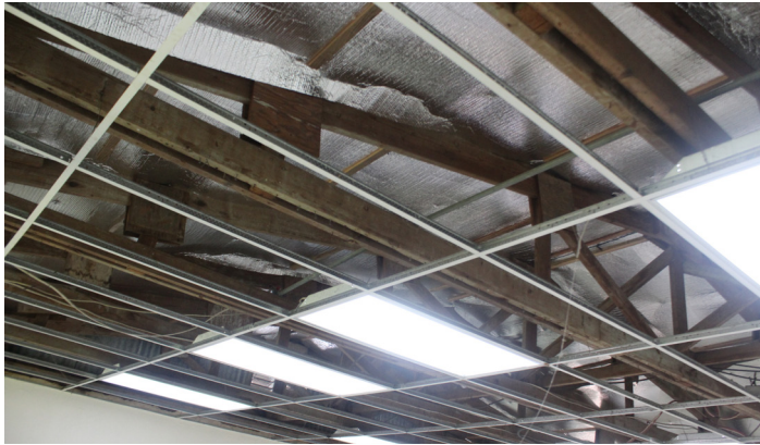
CE training room