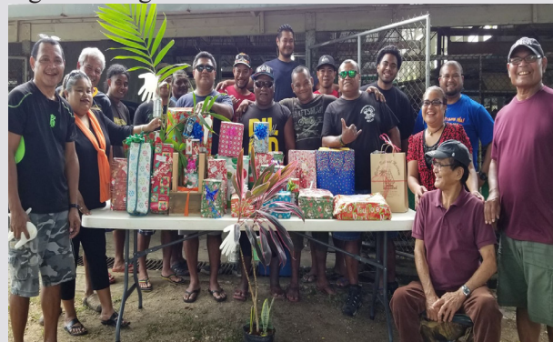
2019 Christmas Party

Funeral service is tomorrow Saturday, April 25, 2020. He will be laid to rest in his home State of Ngerchelung.