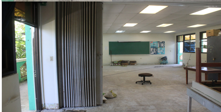
Top: PCC Cafeterium, bottom photo: classroom 66 & 67

For the past weeks, Palau Community College has been the site of one too many construction projects all in preparation for the upcoming 7 th Our Ocean Conference slated for August 17-18, 2020.