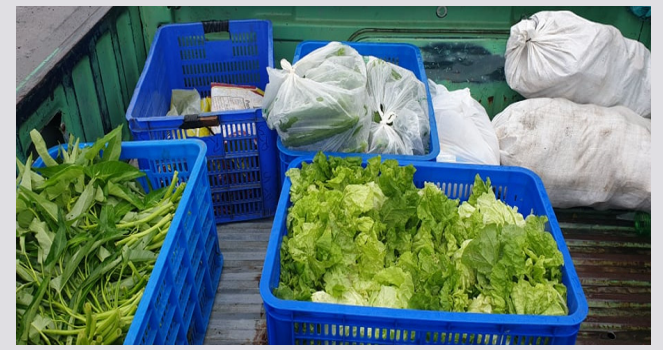
Donations to PCC

On Tuesday, April 28, 2020, PCC received a donation of two (2) sacks of taro, six (6) dozen eggs, two (2) bags of cucumber, one (1) bag of chicken, one (1) bag or pork, one (1) basket of lettuce, and one (1) basket of kangkum. TTM provides assistance and support to numerous organizations and non-citizens including FSM and RMI PCC students living on campus, the Bangladesh Association, the Philippine Association, homebound senior citizens, and those that don't always have the resources and the access for planting or farming. Thank you Taiwan Farm and Technical Mission for your generosity.