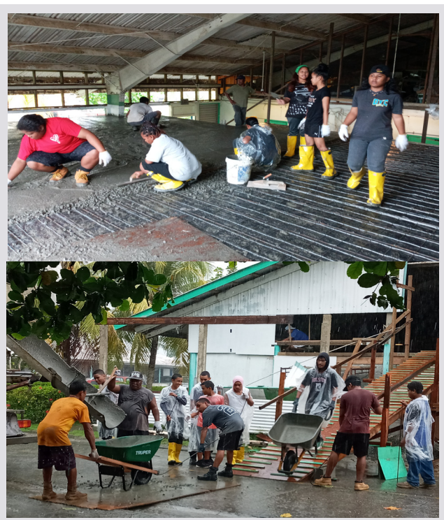
PCC CTE Lab School students cementing the 2nd floor of Tekrar Building for additional PCC classrooms on Tuesday, April 28, 2020.

Individuals who took home the vegetables and fruit plant seedlings provided their contact information to enable follow up on the progress of their home gardens as well as allow MNRET and PCC-CRE to provide technical support in their endeavors to develop their home gardens.