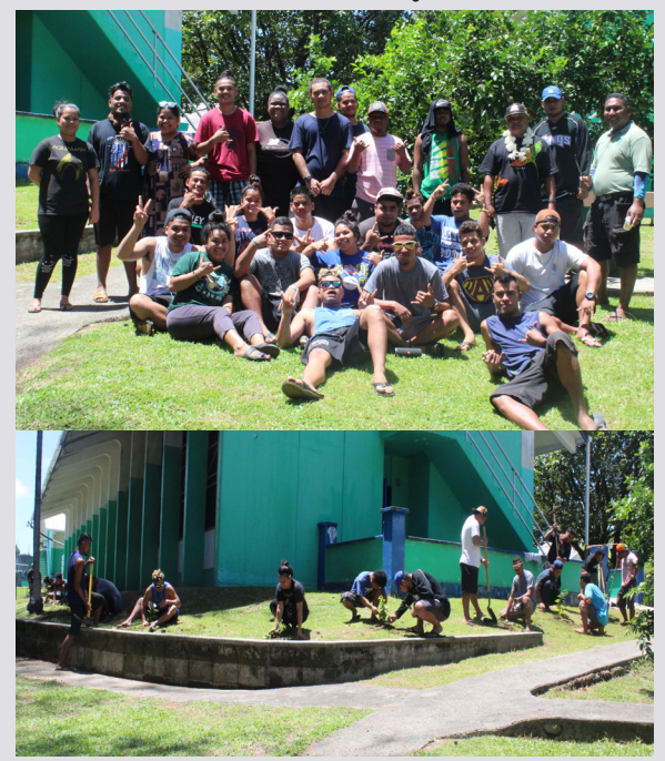
PCC Dormitory Students participating in tree planting activity in observance of Earth Day 2020

PCC CRE and Melekeok PAN Donate to Dormitory Students