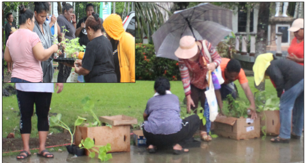
Community receive plants from MNRET and PCC-CRE

On Friday, May 1st, 2020, from 9am to 3pm at PCC Parking lot, the Ministry of Natural Resources (MNRET) and the Palau Community College (PCC) – Cooperative Research & Extension Office offered countless amount of vegetables and fruit tree seedlings to promote household level gardens as part of an initiative to build community resilience in the area of food security.