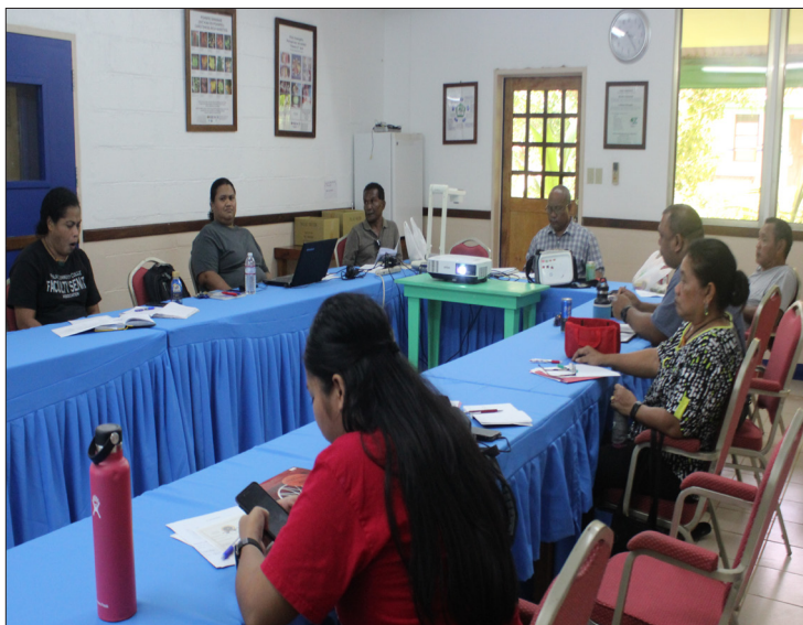
Graduation Committee meeting at PCC Conference Room

On Thursday, May 7, 2020, the Graduation Committee for the school year 2020 met to discuss the details for the upcoming graduation.