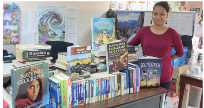
Library staff pictured with book donations