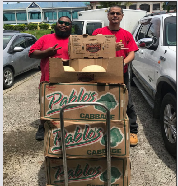
Donations to PCC

On Tuesday, May 5 2020, Palau Community College recieved a donation from Surangel & Son's Super Center which included three (3) cases of head cabbage, three (3) cases of honey dew, and three (3) cases of cantaloupe.