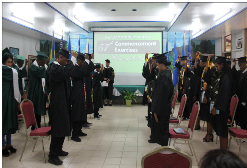
PCC Graduating Class of 2020