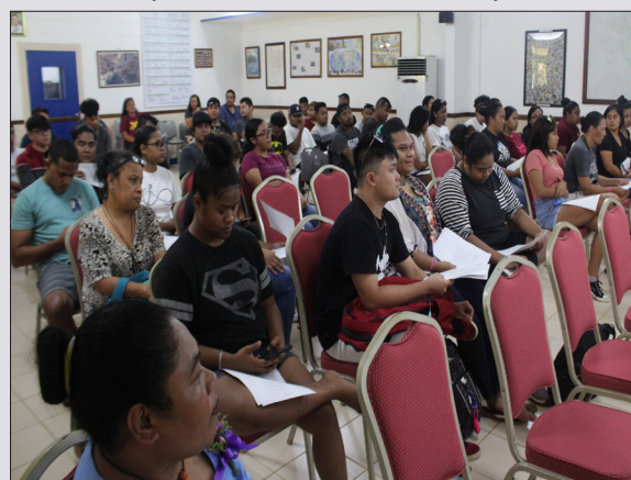
FSA meeting with students at PCC Assembly Hall