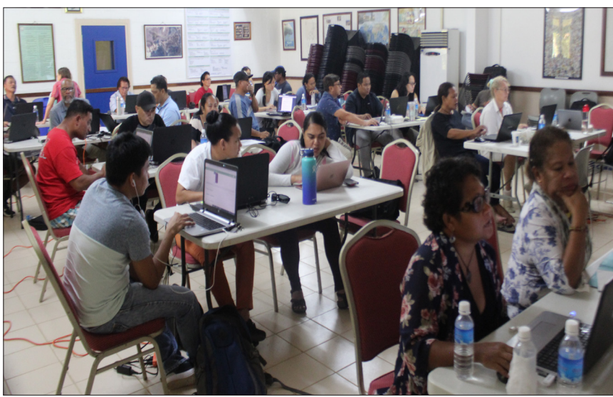
Faculty and Staff meeting / workshop at PCC Assembly Hall

Palau Community College (PCC) Academic Affairs Division conducted an End of the Semeser meeting/ workshop for all faculty and the Faculty Senate Association (FSA) held at PCC Assembly Hall. The End of the Semeser meeting/ workshop began on Tuesday, May 26, 2020 and continued until Wednesday, May 27, 2020. A variety of modes for delivering classes online were covered including the use of Moodle LMS, Google classroom, Zoom video platform and other various corresponding methods by emailing assignments, reading and lectures. The workshop was held to further address the COVID-19 pandemic impact. PCC Summer 2020 and Fall Semester course offerings will be in a format that will address this pandemic. For more information or register for PCC classes, please contact 488-2470 or 488-