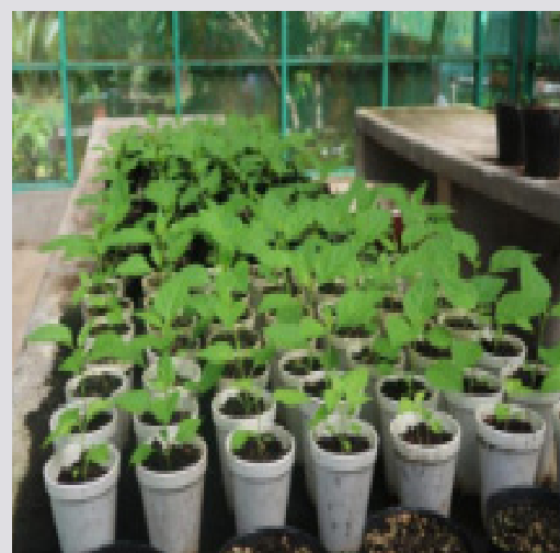
Vegetable and fruit seedlings

One of the objective of the program is to provide vegetable and fruit seedlings for increased local crop production and consumption. The program continues its project delivering vegetable and fruit seedlings to the community.