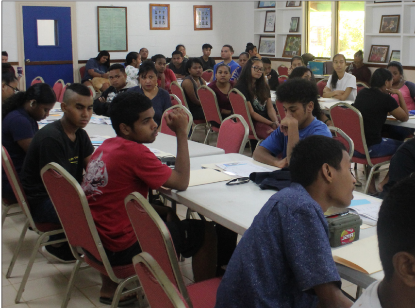
Summer students and PCC Staff at PCC Assembly Hall