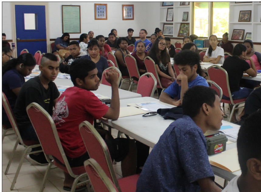
Summer students and PCC Staff at PCC Assembly Hall