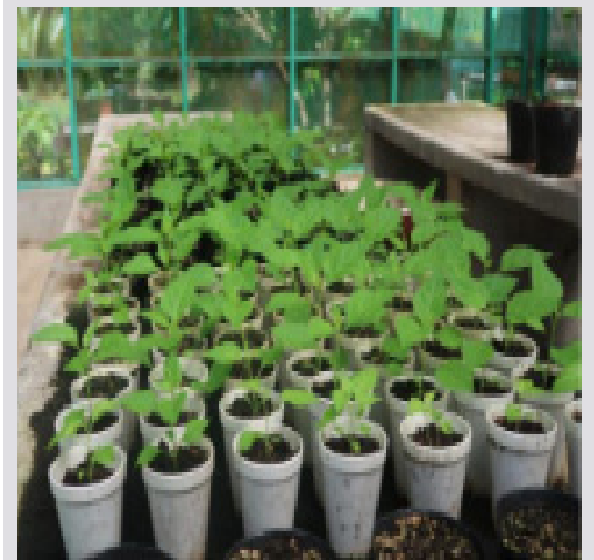
Vegetable and fruit seedlings

One of the objective of the program is to provide vegetable and fruit seedlings for increased local crop production and consumption. The program continues its project delivering vegetable and fruit seedlings to the community.