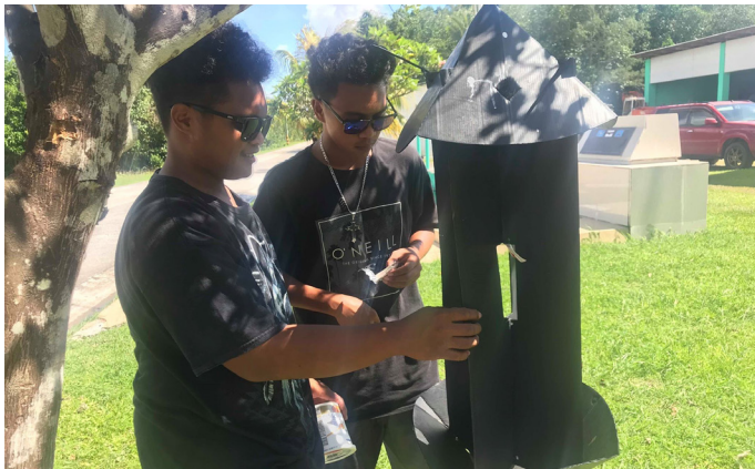
Students Assessing Coconut Beetle

DNA extraction on plant and animal cells, PCR sequencing, data analysis, and GIS mapping. This summer, PCC-CRE with PAIR is offering this opportunity to students who are interested in field-work throughout Palau to learn and teach problem-based learning skills through scientific research. The students will be exposed to real activities and work that is done in Palau and the region to promote future education in science and health; and eventually careers/activities on island that are sustainable.