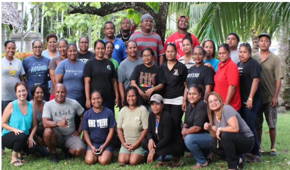
SDSU Bachelors Cohort

There are 18 courses to complete in order for student to receive a bachelor of arts degree. Students are currently on their 16 th course of the program with the final project and video assignments by August 02, 2020. PCC wishes all students in the program much success in the coming weeks.