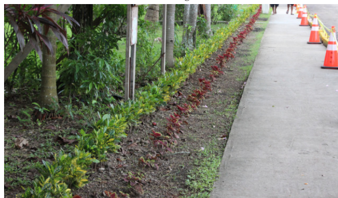
PCC walkway edging plants