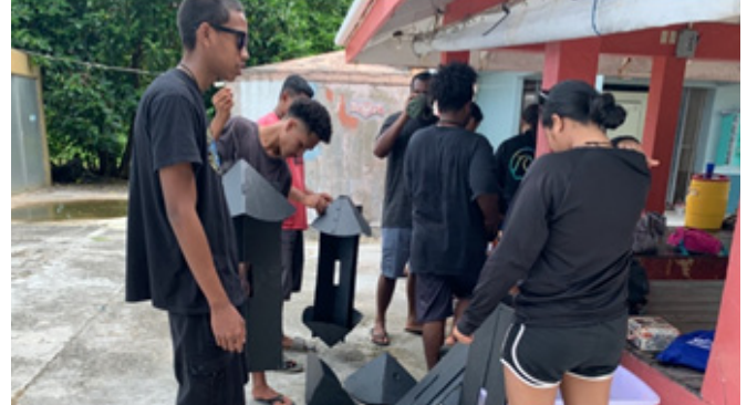
Student Researchers in Kayangel State preparing for a day of assessing and setting traps for rhinoceros beetles