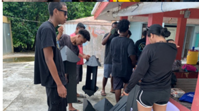
Student Researchers in Kayangel State preparing for a day of assessing and setting traps for rhinoceros beetles