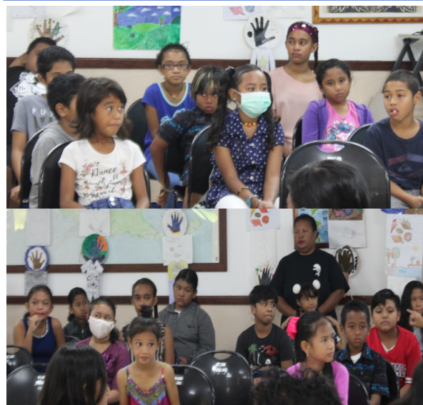
CE Summer Kids Program awarding ceremony at Assembly Hall

On July 10, 2020 Palau Community College Continuing Education held awarding of certificates to over one hundred twenty students from both public and private elementary schools enrolled in this four-week summer program.