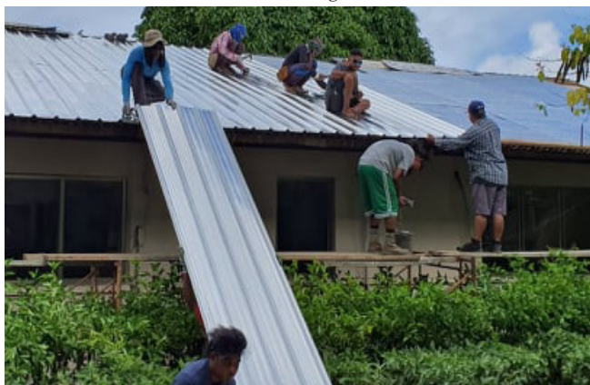
PCC Dort Bldg.