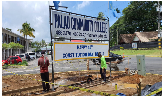
PCC Front Signage