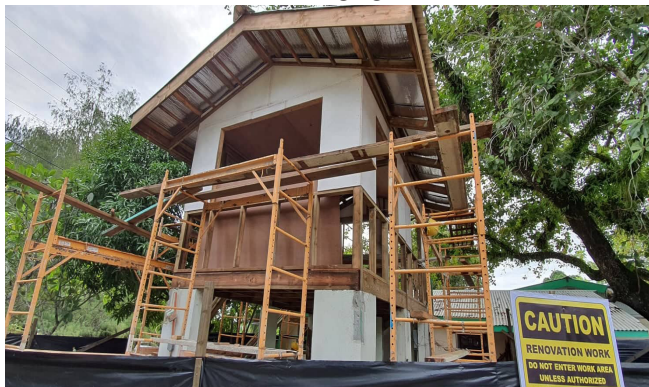
PCC Ewatel Bldg.