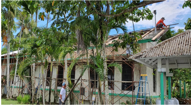
PCC Administration - Ukall Bldg.

The PCC campus buildings continue with major facelift and renovation. This is part of ongoing preparation for the Our Ocean Conference 2020 slated for December of this year.