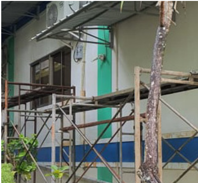
Library right side wall .