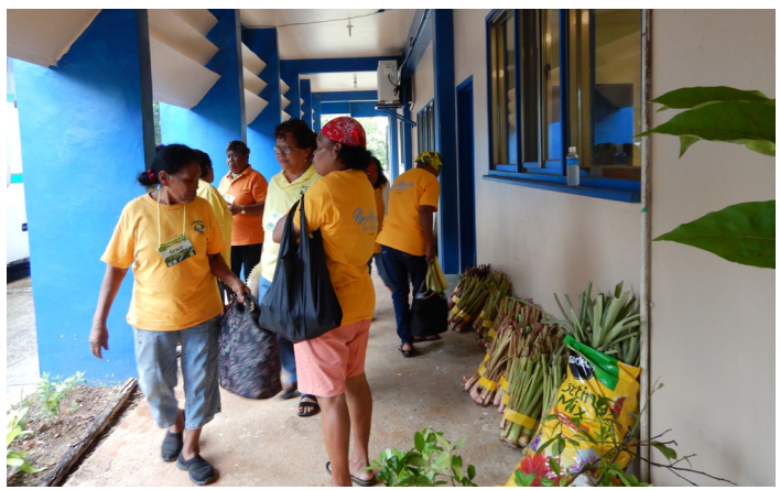
CRE distributed planting materials to Ngara Maiberel womens group