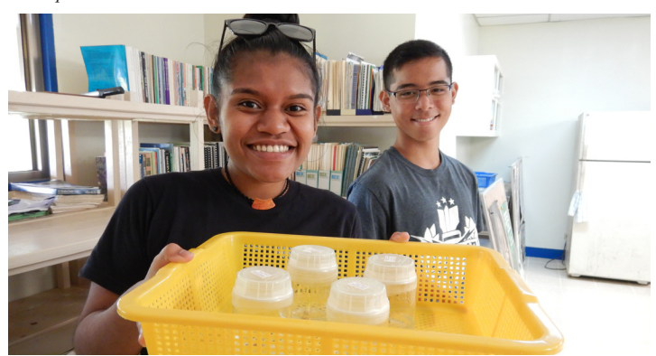
PCC students showcase tissue cultured taro plants