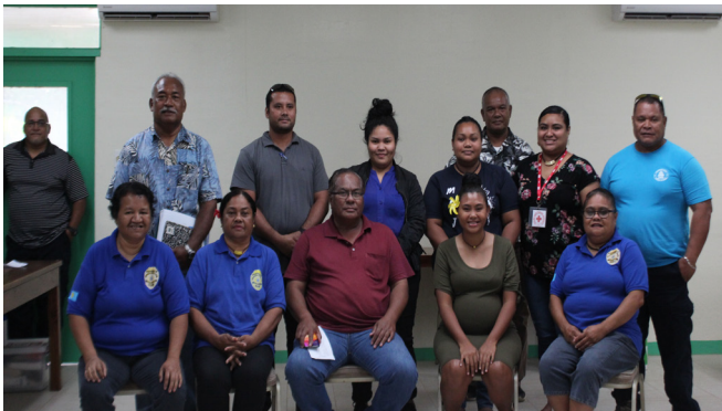
Bureau of Immigration & Labor officers