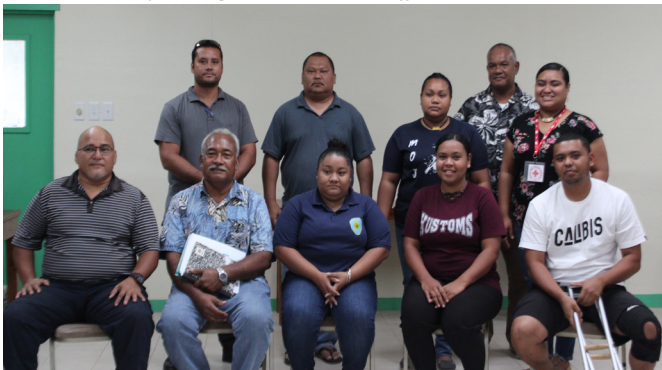
Bureau of Custom & Border Protection officers