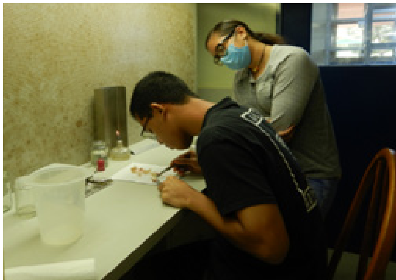
PCC students applying propagation technique on taro plants

Securing local food security as result of climate change and Covid-19 Pandemic is crucial. Taro is one of our island main staple crop and planting materials are being highly sought by local farmers. PCC Research and Development Station in Ngermeskang, Ngeremlengui State continues to entertain local farmers' demands through planting materials distributions as well as other agricultural services. To help ensure farmers with a quality planting materials free of diseases, PCC relies on tissue culture propagation technique. This technique of propagation is conducted inside laboratory in vitro germplasm conservation. It is a reliable solution to mitigate community demand for planting materials. Through this technique, rapid rate and multiplying growth of root crop development can take place and to be transfer to the greenhouse for planting