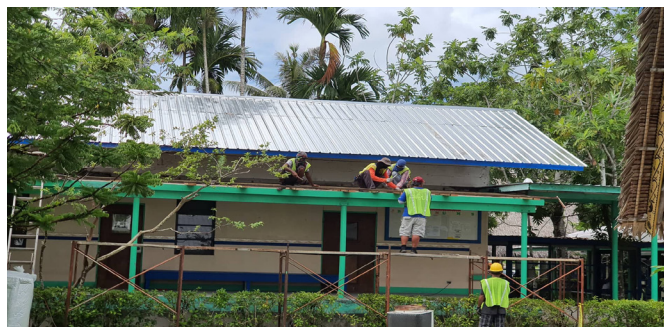
Ukall building front extension roof undergo reroofing as part of college renovation project.

Expected date of program completion is slated for October 2022.