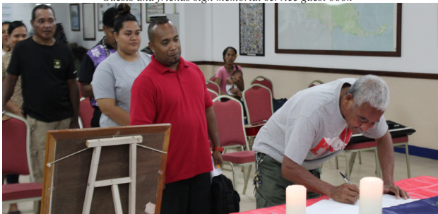
PCC staff and guests during signing of memorial service guest book