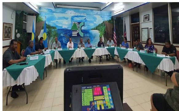
Senatorial Forum Part 2 at Assembly Hall

On Thursday, September 03, 2020 Palau Community College in partnership with Palau Chamber of Commerce, Belau Tourism Association, and Palau Media Council hosted Senatorial Forum Part 2 at PCC Assembly Hall for the ten (10) incumbents and three (3) new candidates for the November 03, 2020 Palau National Election. The forum format was similar to the last senatorial forum part 1 where each candidate shared their ideas and views pertaining to issues facing Palau's economy, government budget, health, labor & law enforcement, front businesses, foreign affairs, and environment. Each candidate has the opportunity to introduce themselves and closing remarks at the end of the program. Each candidate selected a question and read by forum moderator before responding with a time limit of 2 minutes. Candidates who participated in the forum were Sen. Hokkons Baules, Sen. Kerai Mariur, Sen. Mark Rudimch, Sen. Regis Akitaya, Sen. Philip Reklai, Sen. Steve Kuartei, Sen. John Ske-