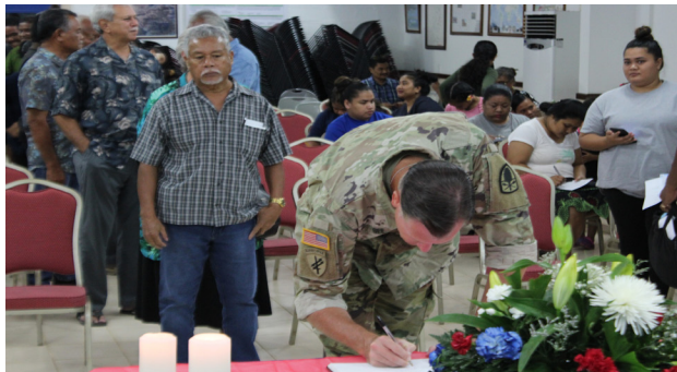
Guests and friends sign memorial service guest book