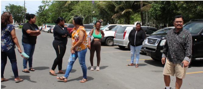
Administration & Finance staff at front parking lot during emergency drill