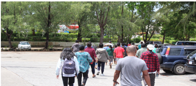
Staff and students from Mitch building heading for safe assembly area