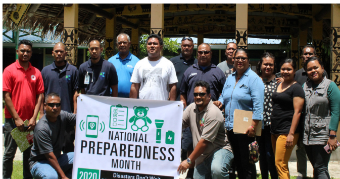
Staff from PCC, MOH, MOJ, PRCS, and NEMO observers during emergency drill