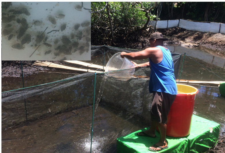
Inset: Mangrove crablets; Rabbitfish and mangrove crab juveniles deliver to ORC farm in Airai

On September 11, 2020, the PCC-CRE aquaculture staff delivered a total of 1,000 mangrove crab and 120 rabbitfish juveniles to the newly established mangrove crab farm of the Oikull Rubak Council (ORC) that is located near Risao Rechirei's residence in Airai State. These juveniles were produced from mangrove crab and rabbitfish seed production projects that are currently being conducted at PCC Hatchery in Ngeremlengui State. The ½ inch sized crablets were temporarily stocked in a stationary net cage that was installed in the watered area of the farm. Crablets will be grown that way until they reach the size that could no longer escape through the holes of the mangrove crab farm's perimeter screen. The kelsebuul juveniles (2 inches in total length) on the other hand, were released directly into the water to be grown together with the crabs inside the farm. PCC also extended technical assistance to Mr. Risawo who is the caretaker of the ORC Mangrove Crab Project by giving advice on the feeding management and monitoring of stock. PCC continues to support the development of mangrove crab and rabbitfish farming in Palau by producing more juveniles