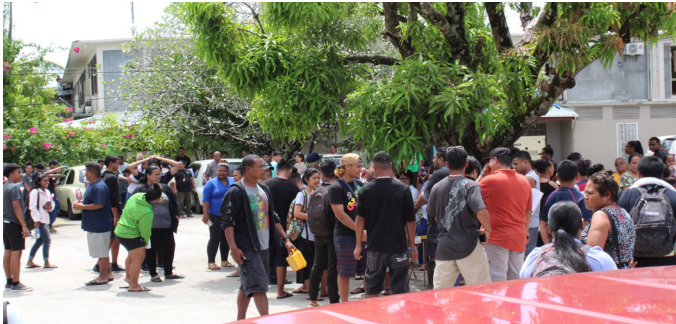
Faculty and staff at Batches building parking lot