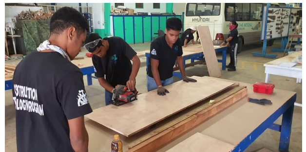
Kitchen cabinet woodworks with CTE lab school students