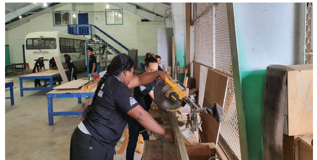
CTE lab school students clothe dresser