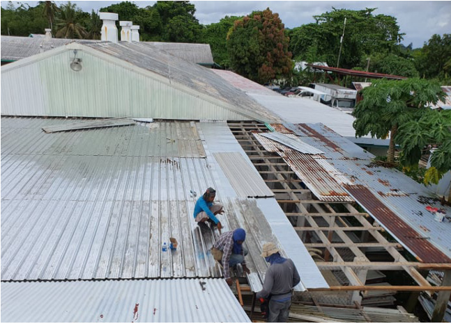
SEOM classroom & laboratory roof replacement

On September 07, 2020 the Palau Community College Small Engine & Outboard Marine Technology program's classroom and laboratory roof were replaced due in part of ongoing college initiative to upgrade and renovate existing facilities.