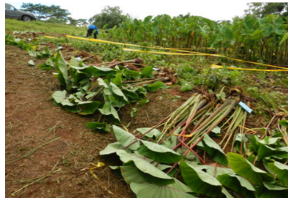
PCC CRE continues with sustainable taro production techniques at R&D station in Ngeremlengui State

The program continues its project in developing sustainable upland taro production techniques by field experiments in PCC, R&D station. The results of the Second Season harvest showed conservation agriculture practices; minimum tillage and mulching with betel nut leaves could give rise to reliable yield and reduce soil erosion from 3-10 times at slope land. In addition, there is high potential to improve the soil quality by increasing soil organic matter content which is critical for sustainable and sufficient local food production. Overall, the results will be described in the sustainable land use for agriculture in the book that is planning to publish by PCC-CRE for dissemination and practical use of the community.