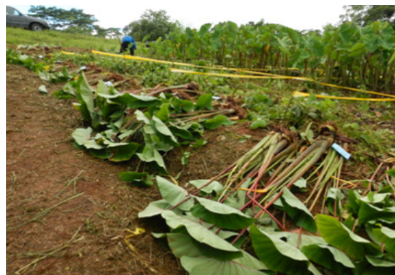
PCC CRE continues with sustainable taro production techniques at R&D station in Ngeremlengui State

The program continues its project in developing sustainable upland taro production techniques by field experiments in PCC, R&D station. The results of the Second Season harvest showed conservation agriculture practices; minimum tillage and mulching with betel nut leaves could give rise to reliable yield and reduce soil erosion from 3-10 times at slope land. In addition, there is high potential to improve the soil quality by increasing soil organic matter content which is critical for sustainable and sufficient local food production. Overall, the results will be described in the sustainable land use for agriculture in the book that is planning to publish by PCC-CRE for dissemination and practical use of the community.