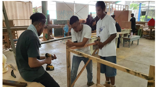
CT students assemble baby crib for class project