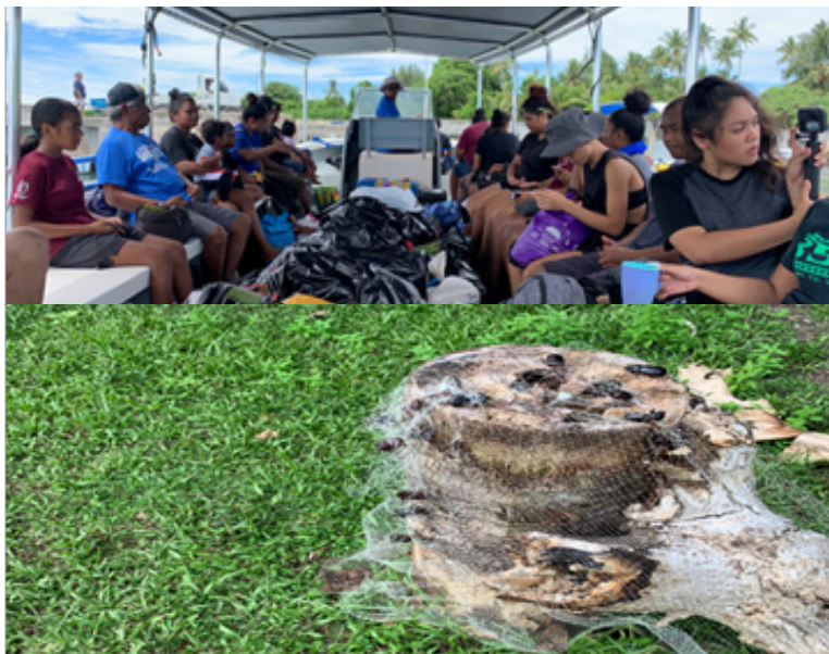
PCC and PHS students with CRE staff follow up visit to Kayangel State

PCC-CRE as a follow up to previous Coconut Rhinoceros Beetle (CRB) and agriculture trips with Kayangel Youth Association and Island Conservation is working directly with the Kayangel State Office to develop sustainable plant protection, agriculture and beautification of the Kayangel Atolls. Through an agreement with PVA and Kayangel State Government several members eligible for re-employment have been allocated to the project. These members have agreed to spend weeks at a time to assist in solid/green waste up and CRB trapping until December 2020. PCC-CRE has been working with PVA and Kayangel State Government to provide mechanism for training and equipping these re-employment members and local team members with the necessary skills and tools to move this project forward. Taiwan Technical Mission (TTM) and PCC Agriculture professionals have provided much needed technical assistance to try to develop this project into a pilot program for reviving agriculture and achieving food security