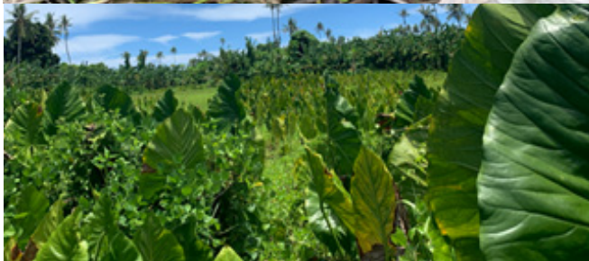
Top photo: solid green waste useable mulch/nutrients for taro patch at Kayangel State