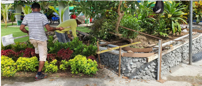
Restoration to corner stone wall right entrance

On September 28, 2020 Palau Community College restore existing cornerstone wall as part of ongoing beautification project in anticipating Our Ocean 2020 conference slated for December 7-8, 2020. PCC recognizes the hard work put in by the maintenance staff and thank them for keeping our campus dazzled and elegant.