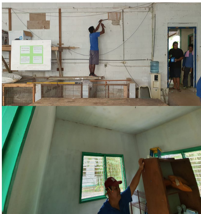
Agriculture Lab and Talent Search storage room

PCC Agricultural laboratory and Educational Talent Search storage room undergo minor renovation including new painting.