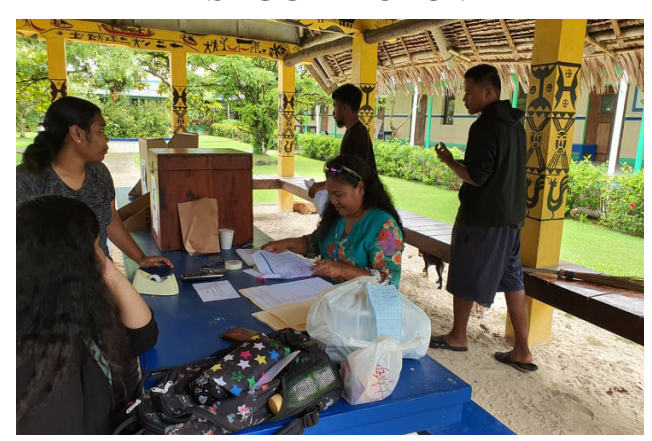
ASPCC Election at Mesekiu Bai

On October 14, 2020: ASPCC held its election at Mesekiu Bai for the 2020-2021School Year. Student Services staff were present to conduct the election.