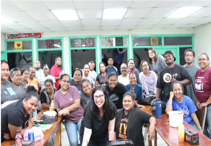
SDSU Bachelor's Cohort Class of 2021

SDSU bachelor's cohort begins their last course of the program.