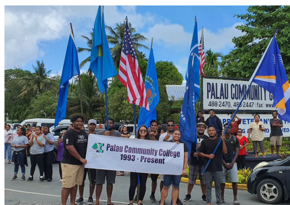
PCC students holding college banner after the U.S. Veterans Parade at Ernguul road

On November 11, 2020 Palau Community College students joined the Veterans of U.S. Armed Forces in Palau (VUSAFP) to commemorate the U.S. Veterans Day. This is the first time that VUSAFP holds such event to recognize Palauans in the armed forces who paid the ultimate sacrifice in serving and defending both U.S. of America and the Republic of Palau since September 11, 2001 attack on the United States.