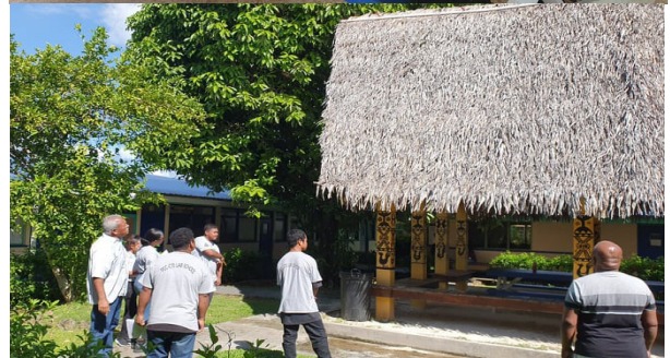
On November 09, 2020 PCC CTE Lab School students and their instructor were familiarized with Abai structural design and traditional Palauan myths inscribed in the beams, posts, and gables.

Show your support for the 2020 PCC Thanksgiving Endowment Fundraising Event by purchasing a $10 Raffle Ticket! Your support will help Palau's only institution of higher learning continue to provide the much needed academic programs & training that will help sustain the future of our island workforce.