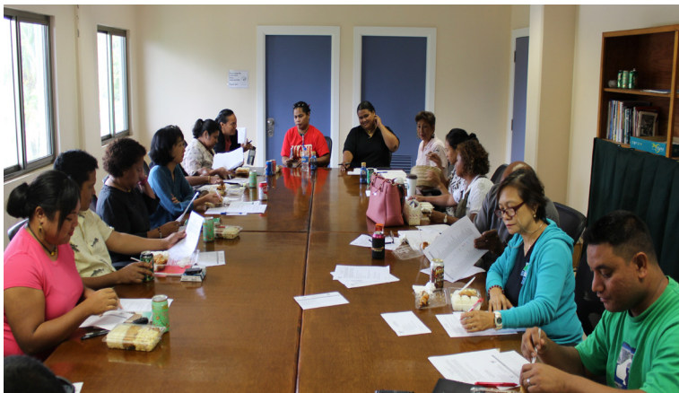
Faculty Senate Association during regular meeting at Academic Affairs Faculty Conference room

On November 19, 2020 Palau Community College Faculty Senate Association (FSA) held a scholarship awarding ceremony at Faculty Conference room. This is an annual ceremony to recognize and congratulate PCC students who applied for the association's scholarship for academic year 2020-2021. The scholarships are offered to both the first year and second year students who maintain cumulative grade point average of 3.0 in any field of study. The recipient of the scholarship will be awarded $250 for Fall & Spring semester. FSA is a non-profit educational association dedicated to support student learning opportunities and academic excellence. Each year, the FSA holds Gentlemen's Gourment fundraising event to raise needed funds to support its student scholarship program. FSA will announce the recipients of this year's scholarship award in the next issue.