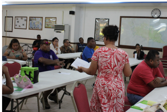
CSO Regular Meeting

On November 18, 2020 Palau Community College Classified Staff Organization (CSO) held its regular meeting at Continuing Education training room to discuss and plan for annual activities.