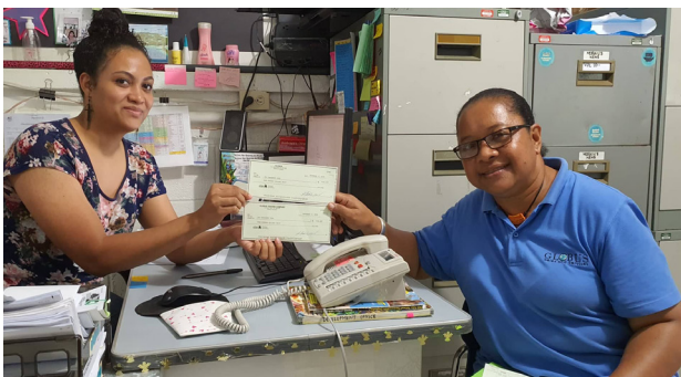
Globus & Globus Trading donating $300 to endowment fundraising.