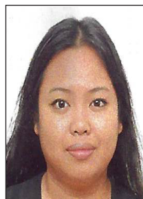
Caren R. Castillo Terry Ngirmang Nursing Scholarship