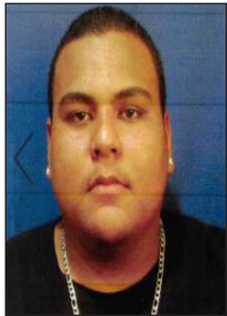
McDowell Wachi Sandra S. Pierantozzi Scholarship

The PCC Based Scholarships are awarded each academic year to full-time students enrolled in a degree program with cumulative grade point average (CGPA) of 2.50 or higher.