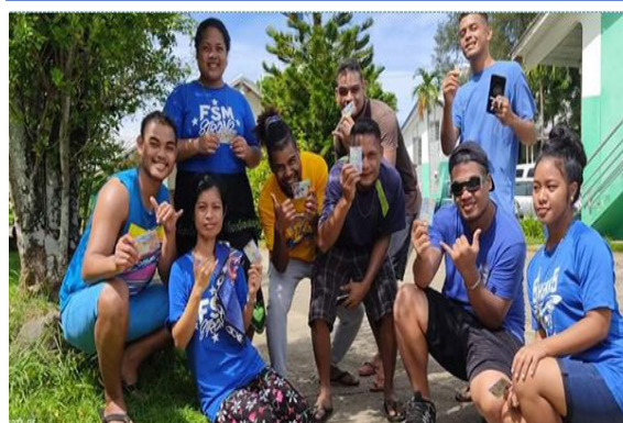
PCC dorm students during end of the semester fun & games activities.

Palau Community College dormitory students celebrated end of the semester activity with fun & games before entering the spirit of holidays.