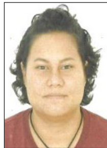
Xia Ebsang Taima Terry Ngirmang Nursing Scholarship