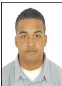
Andrew N. Rengechel Sandra S. Pierantozzi Scholarship