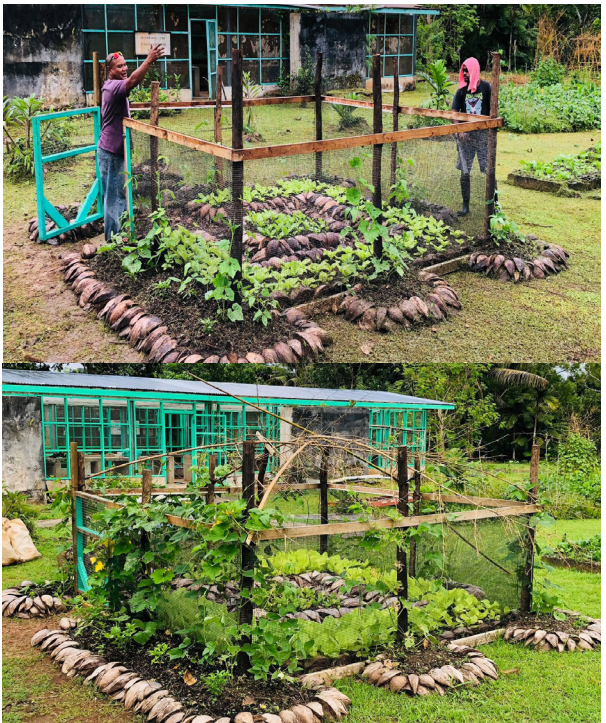
Top: PCC CRE extension agent Felix Sengebau showcasing new backyard vegetable garden

PCC CRE Introduces 10' x 10' Backyard Garden