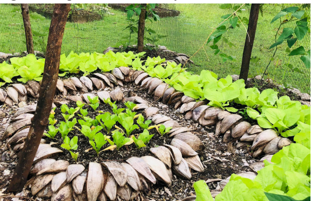
Inside glimpse of backyard garden at PCC CRE R& D station

PCC CRE Backyard Garden Continued from p.1 are currently monitoring the vegetable garden and collecting necessary data for futher analysis and recommendations for improving planting techniques and maturity rate.