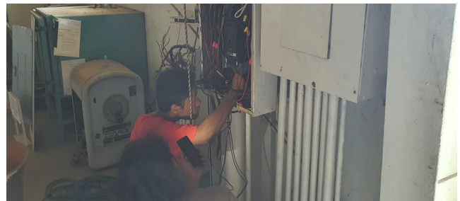
Maintenance staff replacing electrical wires at Tekrar and Demul buildings due to blackout.