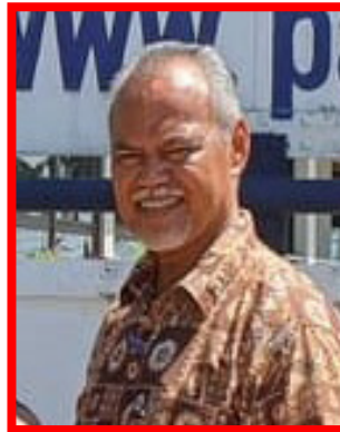
Senator Andrew Tabelual

Thank you for your contributions to Palau's only institution of higher learning! Your donations will help sustain the future stability of our college.