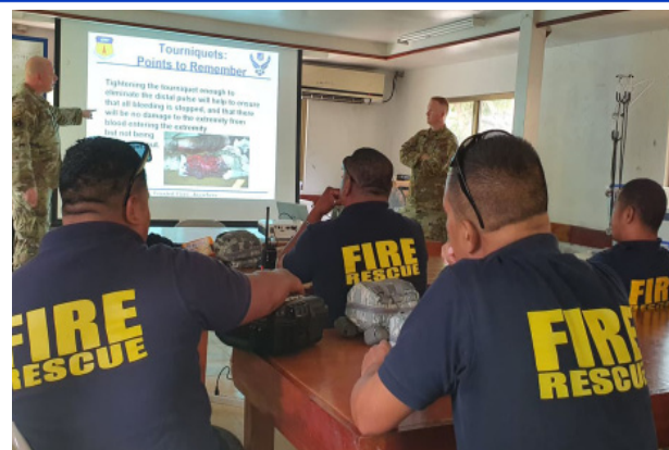
EMT Refresher Training at PCC CE Ibokill training room

On February 8-22, 2021, the Emergency Medical Technician Refresher Training was administered to 17 Ministry of Justice Fire & Rescue officers. This training covers basic competency learning modules where officers learn to recognize, assess, and manage medical and trauma emergencies. The purpose of the training is to refresh skills and knowledge on how to save lives and learn new ones to enhance their performance on the job. As first responders, the need to have training on the basics of using appropriate equipment, control bleeding, shock management, immobilization of spine or joint, managing vital signs and temperature.