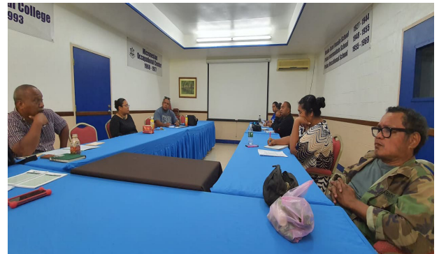
Graduation Committee during an organization meeting