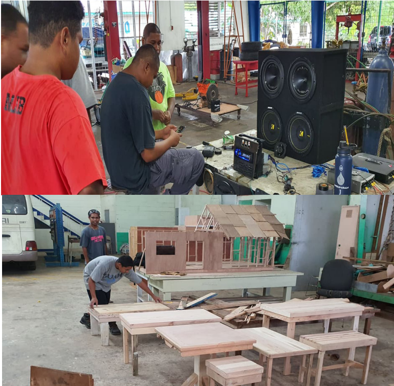
Automotive Mechanic Technology & Construction Technology students setting up for the upcoming CTE Awareness Week

This week, Palau Community College Career & Technical Education programs are in full gear in preparation for CTE Awareness Week slated for March 17-18, 2021. This annual college event provides practical hands-on information on various academic programs for Palau's elementary and high school students in two-days during Ministry of Education's public school awareness week. There are 21 academic programs offered at the college. Schools are encourage to select academic stations for which they will visit during the tour. PCC had invited all high schools in Palau including the follwing elementary schools, Ngarchelong, Ngaraard, Melekeok, Ngeremlengui, Ngatpang, Aimeliik, Airai, Koror, Meyuns, Maris Stella School, George B. Harris, and Seventh Day Adventist schools. Over 200 students are expected to participate in the college awareness week event.