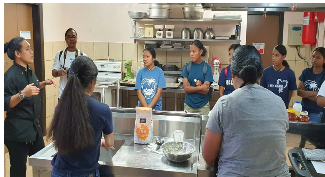
Tourism & Hospitality Program