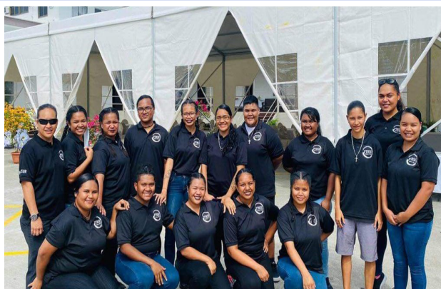
Tourism & Hospitality students at the Supreme Court