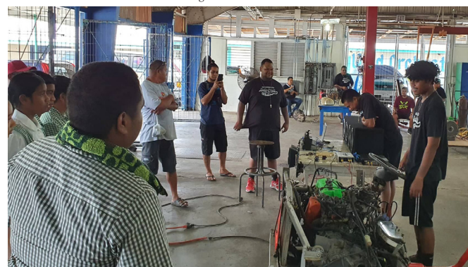
Automotive Mechanics Technology