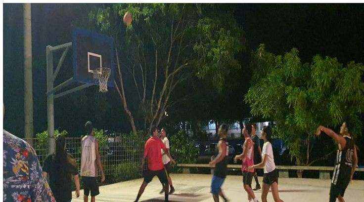
PCC Intramural Basketball Tournament

For the past two weeks, PCC Recreation sponsored intramural coed basketball tournament with players comprised of students and staff. Teams are ISO, ASPCC, Maintenance, CTE Lab School, Combo 15, and Micro-Mix. On Wednesday, March 24, 2021, Micro Mix played against ASPCC but fall short of 3 points to give ASPCC a shot at Championship slated for next week.