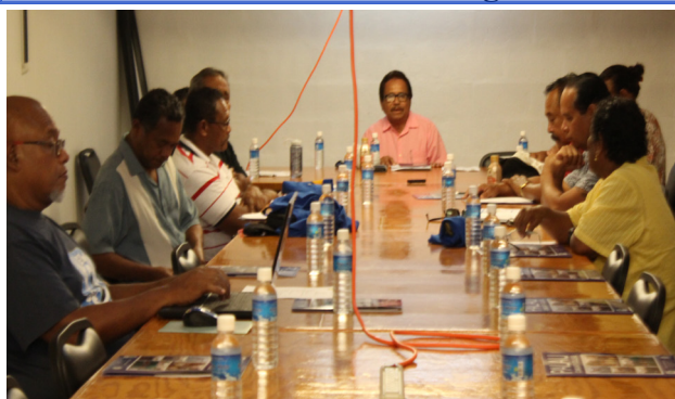
Governors Association meeting at Temekai Conference room